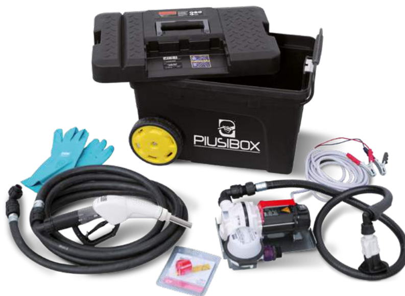
PIUSIBOX FOR ADBLUE®